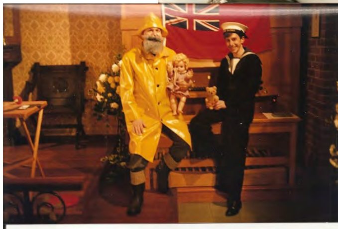
NEW YEAR PARTIES 1986 Nautical Night Entertainment: The Wreck of the Hesperes