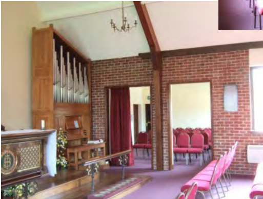
View into the chapel from the chapel, showing the curtain which can be drawn across as required