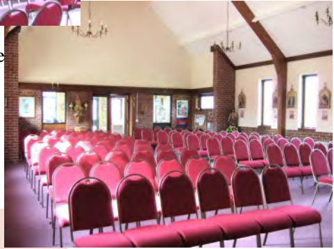
Right: Viewed from the chapel opening towards the rear of the church and the narthex