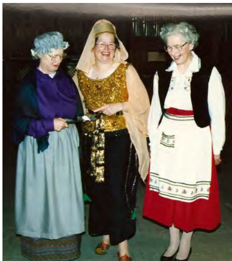
1990 A selection of characters From Childrens' Stories