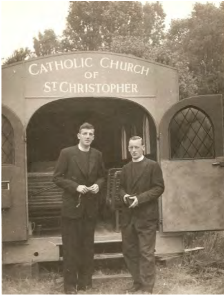
THE EARLY DAYS Fr. Cormac Murphy O'Connor, later Cardinal Archbishop of Westminster, on left, outside the mobile chapel in 1958, prior to erection of the new church