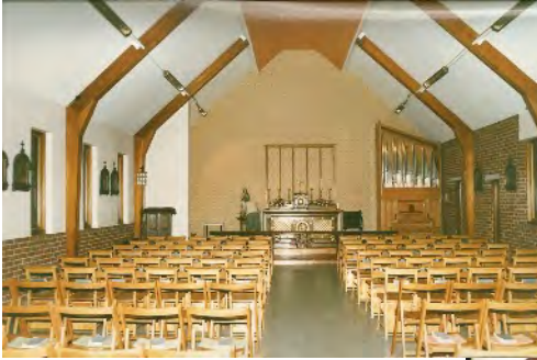
BEFORE Wallpaper on sanctuary wall. Ceiling heaters. Tiled floor.