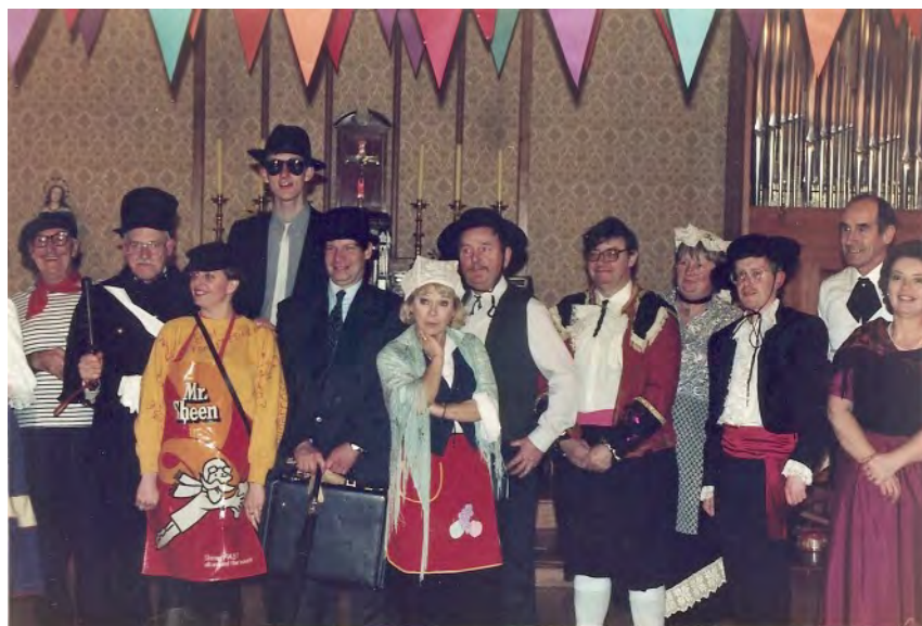
1992 European Night