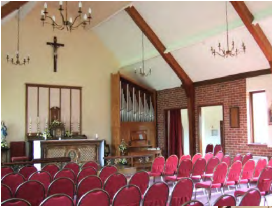
Above: Looking from the rear of the church towards the chapel.