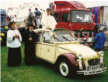
Above: Hoveton Village Fete. Arrival of St.Helen's 'Popemobile'. The 'poppe' married the next week!