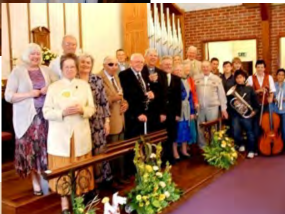
Below: The sanctuary and one of the arrangements from the flower festival held the same weekend