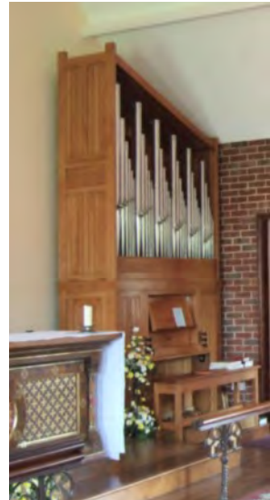
The pipe organ was erected in 1979 by Nigel Church of Stamfordham, Northumbria from a Swiss design