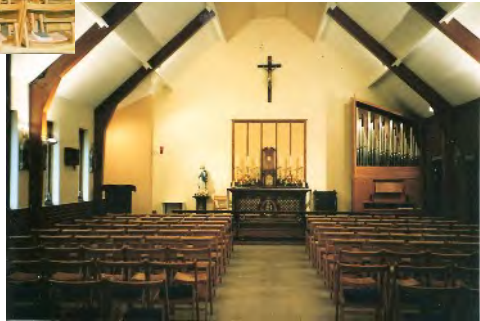
AFTER Church refurbished. Repainted and carpeted Wall heaters Old Spanish Crucifix on wall New tabernacle top