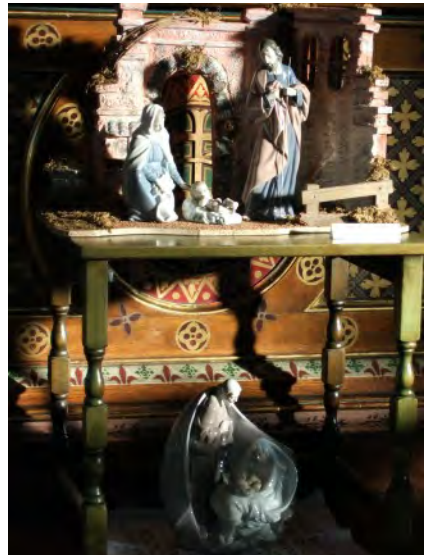
Right: Christmas 2003 Part of the large display of cribs