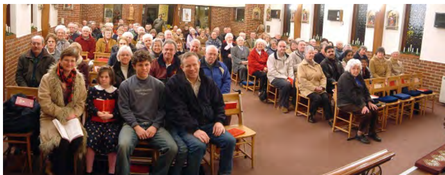
December 2006. Photos of St.Helen's congregation sent to our Cambodian twinned parish at Svay Sisophon