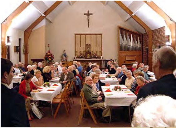
2005 Annual Harvest Supper Waiting for the starting gun!